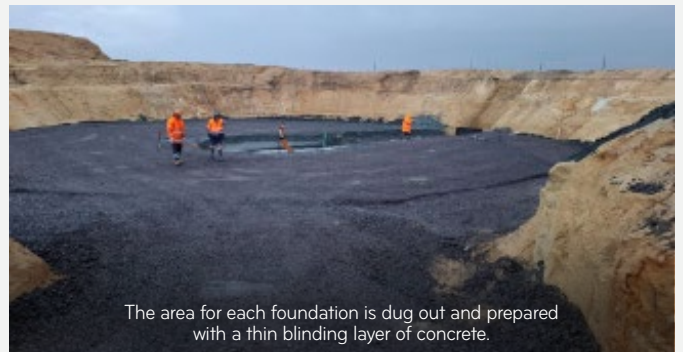
The area for each foundation is dug out and prepared with a thin blinding layer of concrete.