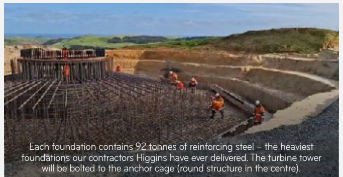
Each foundation contains 92 tonnes of reinforcing steel – the heaviest foundations our contractors Higgins have ever delivered. The turbine tower will be bolted to the anchor cage (round structure in the centre).