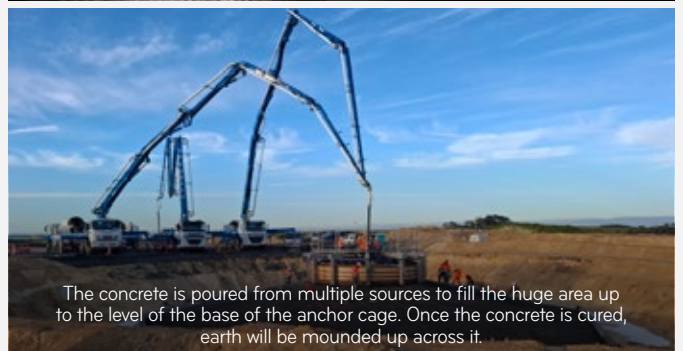
The concrete is poured from multiple sources to fill the huge area up to the level of the base of the anchor cage. Once the concrete is cured, earth will be mounded up across it.