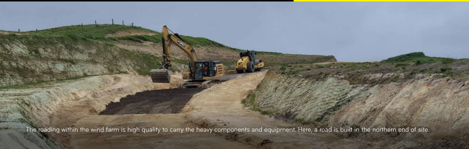
The roading within the wind farm is high quality to carry the heavy components and equipment. Here, a road is built in the northern end of site.