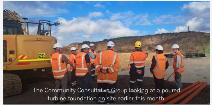
The Community Consultative Group looking at a poured turbine foundation on site earlier this month.

A live trial run of the transport from port is planned for overnight in mid-November – this will test whether the longest loads will get through from port at Whangarei to our site. This is the culmination of all the desktop planning and crews working on SH14 and SH12 to widen or straighten corners and, where necessary, to remove or replace signs and fencing.