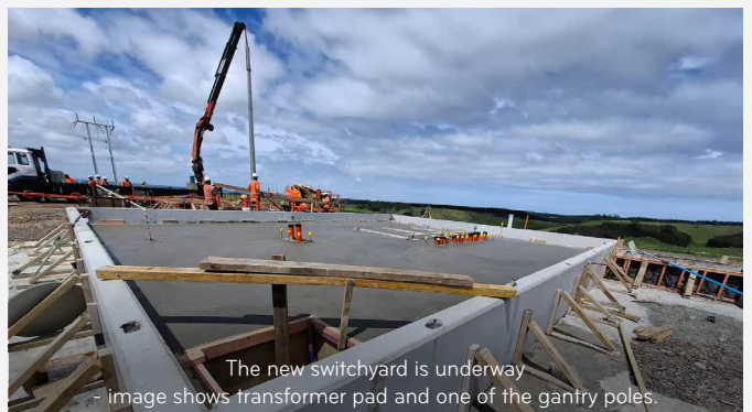
The new switchyard is underway - image shows transformer pad and one of the gantry poles.

They told us "we are glad we can enable infrastructure to support renewable generation, and upgrade our network to be more resilient in the long run and would like to extend our sincere thanks for everyone's patience". For more info, see their website ( https://northpower.nz/case-study/mercurys-kaiwaikawe-wind-farm )