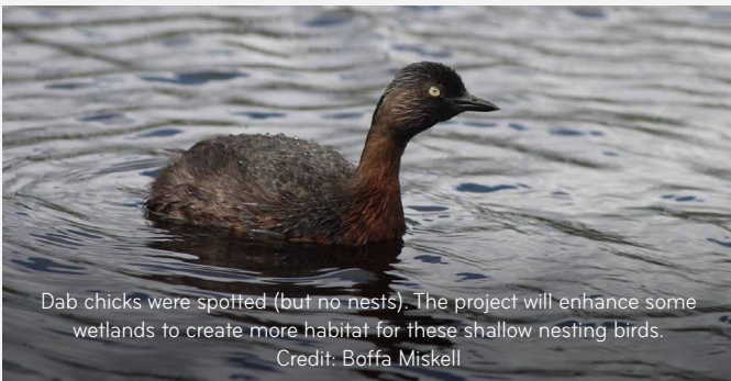
Dab chicks were spotted (but no nests). The project will enhance some wetlands to create more habitat for these shallow nesting birds.

Speaking of Christmas, we were stoked to be asked by Rotary if we would support the Dargaville Christmas parade. Of course we will – we're definitely Christmas joy-ful to join Raine & Horne as major sponsors. Looking forward to seeing you at the Parade on 6 December. We'll be the ones in the yellow t-shirts.